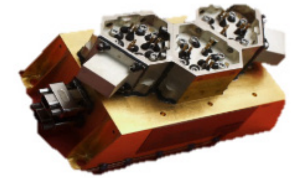
Beam Hopping Unit